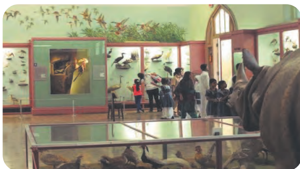
Fig. 1.3 Biological Museum

Thus, biological museums in educational institutes are reference hubs of biodiversity studies.