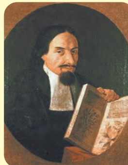
Prof. Luca Ghini

In 1543, first botanical garden of the world was established by an Italian Prof. Luca Ghini (A. D. 1490-1556) at Pisa, Italy. Botanical garden at Kew in England is known for largest collection of more than 30,000 specimens (preserved plants) and more than 7 million herbaria.