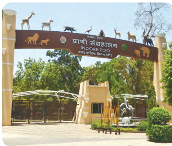
Fig. 1.4 Zoological Park

Flora, manuals, Monographs and Catalogue are some other tools of maintaining biodiversity records. Flora is the plant life occurring in a particular area on time. A Monograph describes any one selected biological group where as manual provides information, keys about identification of species found in a particular area.